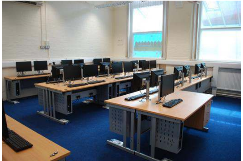
After <u>Structured cabling and outlet locations:</u>

Woodside also required a bespoke workbench. The bench would be used for the storage of computer and printer peripherals and secondly for the ICT team to use as work space. Netcom supplied and installed a 3000mm wide x 600mm deep x 730mm high work bench. The bench included three storage cupboards one of which is lockable.